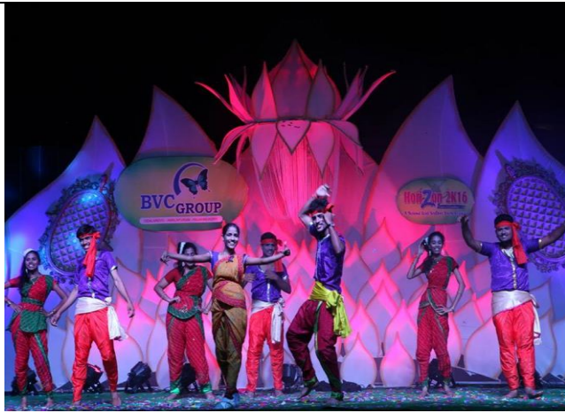
Stage performance for HORIZON 2K16